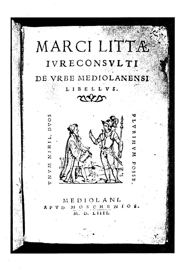
PLATE 1: Title page by Simone and Francesco Moscheni, Milan, 1553, showing Francesco's mark of the complimentary nobility of letters and arms, with the Latin motto used on scholarly books.